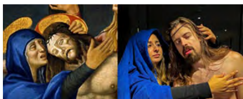
Lamentation of Christ